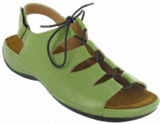
Wolky's Ultra-Light Kite in Apple