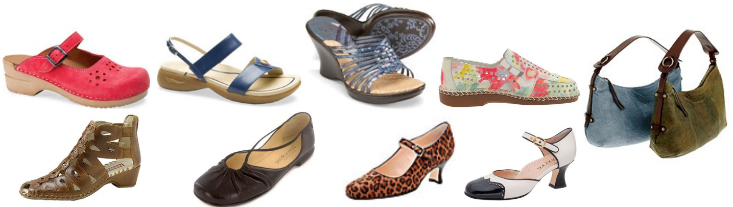
Pictured above from left to right, top to bottom: Dansko's Merrie and Didi; Söfft's Corsica; Rieker's Susan; Ellington's Riviera handbags; Pikolinos' Romana; Taryn Rose's Bijou; and Anyi Lu's Bella and Shirley.