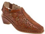
Pikolinos' handbag and Romana mule

Pikolinos is a premium brand that sets itself apart from others with beautiful leathers, color and designs that showcase their European aesthetic while holding extremely high standard for comfort. Their fundamental idea is to offer footwear products that are unique, and combine personality with comfort and high quality. Pikolinos utilizes lead-free, vegetable tanned leathers with a natural tanning process