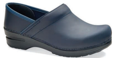
Dansko's Professional in Blueberry

multi-use building is being constructed according to standards established by the U.S. Green Building Council's Leadership in Energy and Environmental (LEED) program. It features vegetated roofing, under floor heating and cooling and solar hot water. One of Dansko's missions is "to leave the world a better place than we found it." (Source: Dansko.com)