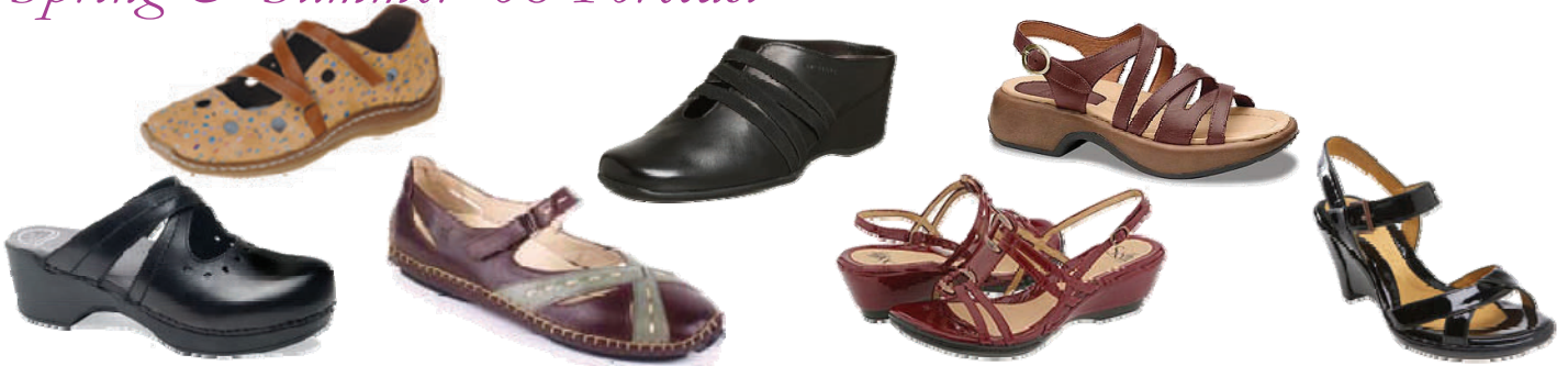
Left to right: Dansko's Susana; Rieker's Celia; Pikolino's Olmo; Stonefly's Silvia; Sofft's Adara; Dansko's Lolita and Sofft's Galen